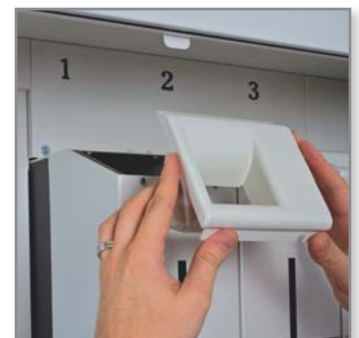
Image 3: Some of the machine’s bezels are produced via direct digital manufacturing because the custom configuration calls for low volumes of these parts.