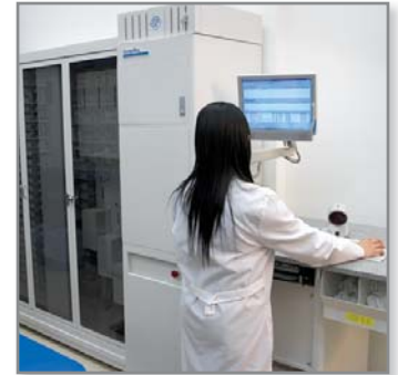
Image 1: Pharmacist using ScriptPro SP 200 Automated Pill Dispensing System.