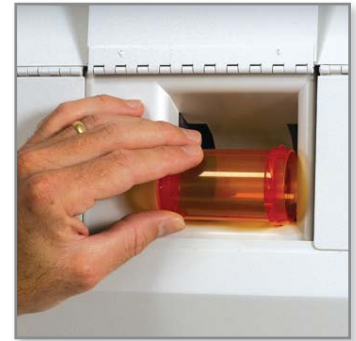
Image 4: Loading vials into the pill-dispensing machine. Each bezel allows only the correct vial type to be accepted.

“We had a savings of about $30,000 on engineering time and tooling for the bezel alone. Add in the other parts, and the machine paid for itself within months of our purchase.”