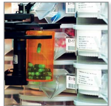
Image 5: A robotic arm picks up a vial, takes it to the dispensing cell for filling, then places it on a conveyor.