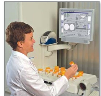
Image 6: After labeling, the conveyor moves the vial into a collated collection station

For more information about Fortus systems, materials and applications, call 888.480.3548 or visit www.fortus.com