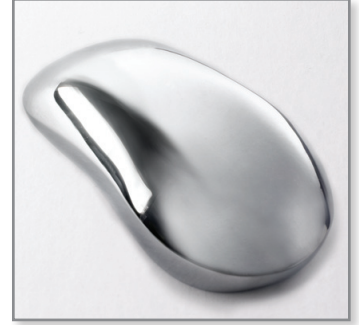
Electroplated Part: Finished part with functional and decorative copper-nickel-chromium plating.

Supplies are readily available at hardware stores, hobby shops and industrial supply companies.