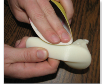
Figure 4: Sand surfaces.

There will be solvent trapped in the part after the sealing process. If electroplating is attempted before the solvent has completely evaporated, the plating material will bubble and peel off of the part. Allowing the part to dry for a minimum of 18 hours will ensure that no solvent