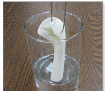
Figure 5: Sealing. Seal the part's surfaces by dipping in solvent.