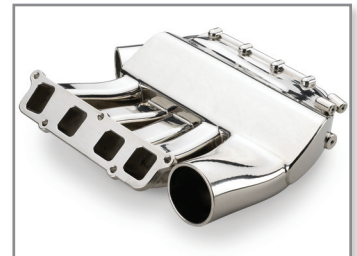
An electroplated FDM part.