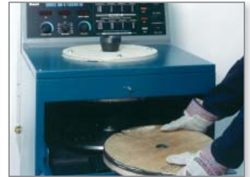
Figure 6: The mold is loaded into the spin casting machine.