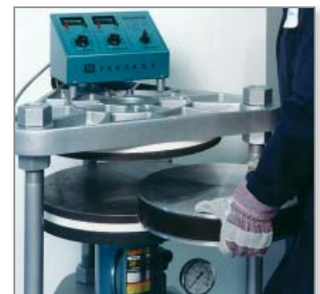
Figure 4: The mold is loaded into a vulcanizer that cures the rubber.